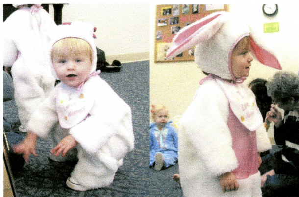
Bunnies for Halloween