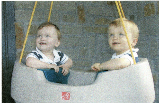
After first haircut July 04