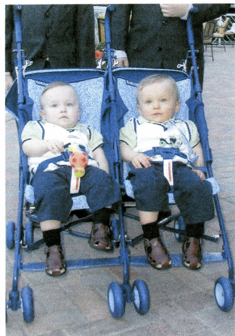
Christening in Florida May 04